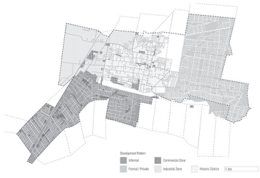
Informal and Formal Land Development- Street Organization as a Method of Control