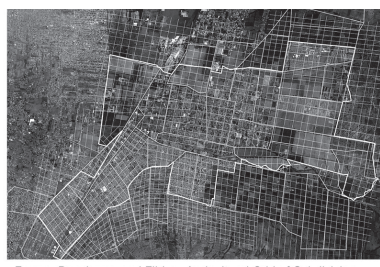
Former Rancheros and Ejidos- Agricultural Grid of Subdivision

In response to corrupt or absent governance, radical social organizations have promised to fulfill the needs neglected by the state. In recent decades, organizations have claimed swaths of land – often previously ejidos – for peasants and other disenfranchised citizens largely ig-nored by the Mexican government.