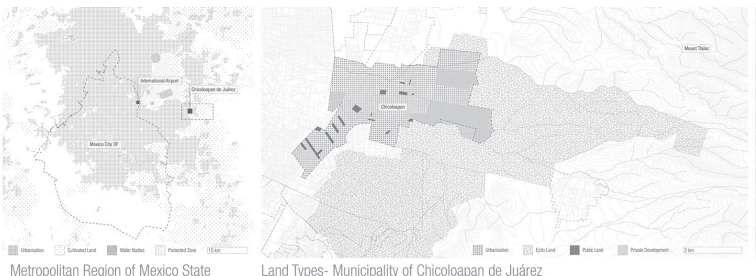
Metropolitan Region of Mexico State Land Types- Municipality of Chicoloapan de Juárez