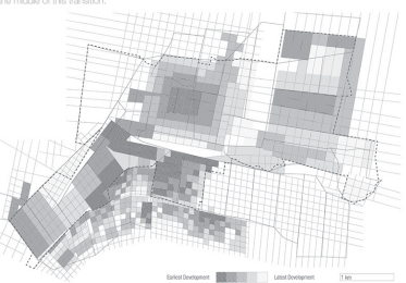
Urbanized Land Expansion Following Former Ejidal Boundaries